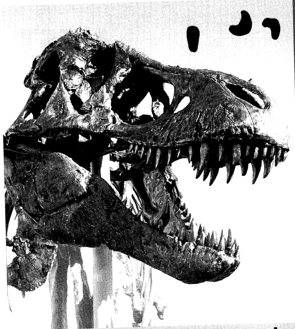
38 ft. long bronze T-Rex made for the Museum of the Rockies, Bozeman Montana, 2001.